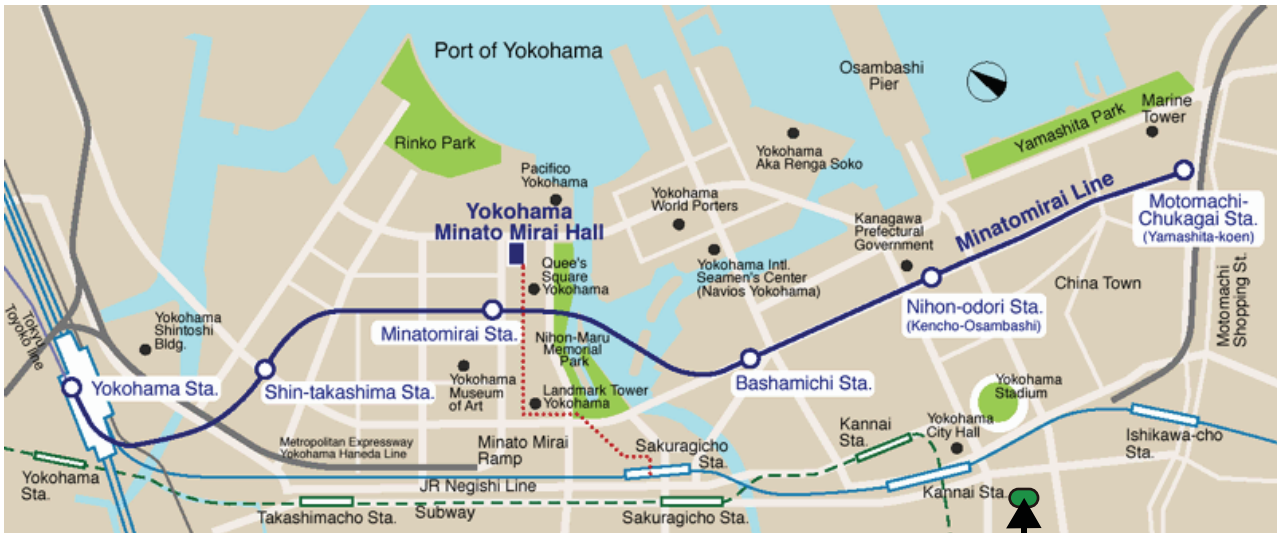
Yokohama Cultural Gymnasium

<Access> JR Line / Yokohama Municipal Subway 5-min. walk from Kannai Station