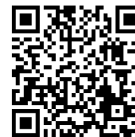
Written Pledge for Quarantine