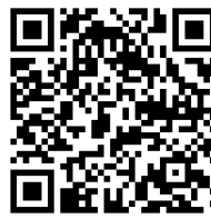
Questionnaire for Quarantine