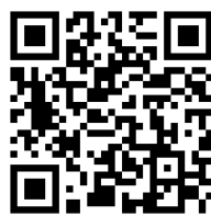
Negative Test Result Certificate before departure